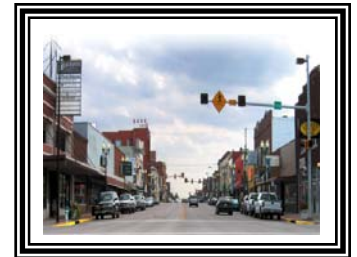
Main St in El Dorado