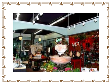
Walter's Flower shop

Are you an Administrative Assistant working for City Government in Kansas? Won't you consider joining AAKC?