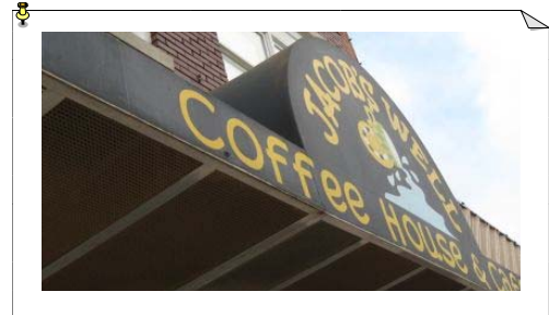
Jacob's Well Coffee House & Cafe'